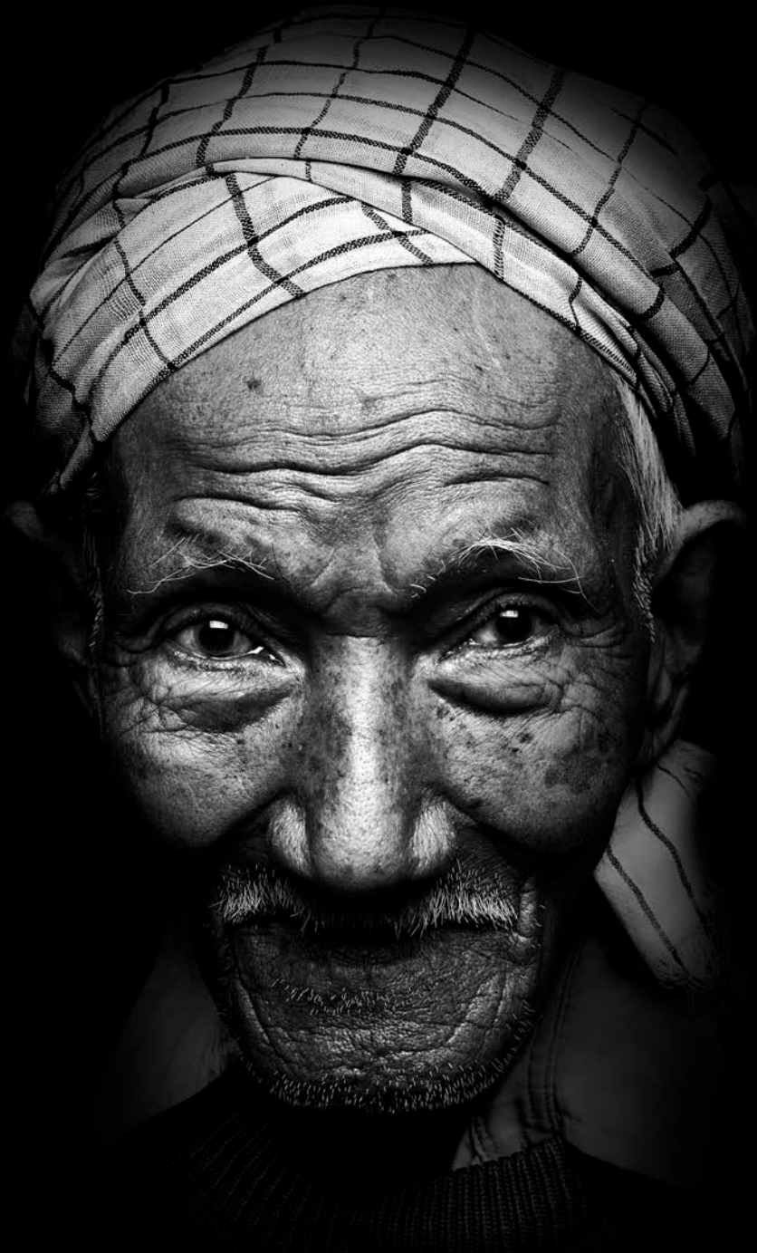
SJ/P/09 | 67"X55" | ARCHIVAL PRINT ON CANVAS | INR 3,50,000 + GST