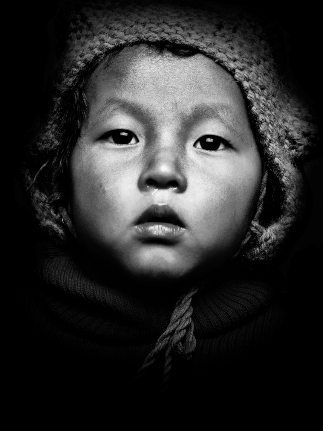
SJ/P/12 | 67"X55" | ARCHIVAL PRINT ON CANVAS | INR 4,00,000 + GST